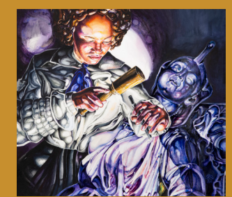
30 x 30in.